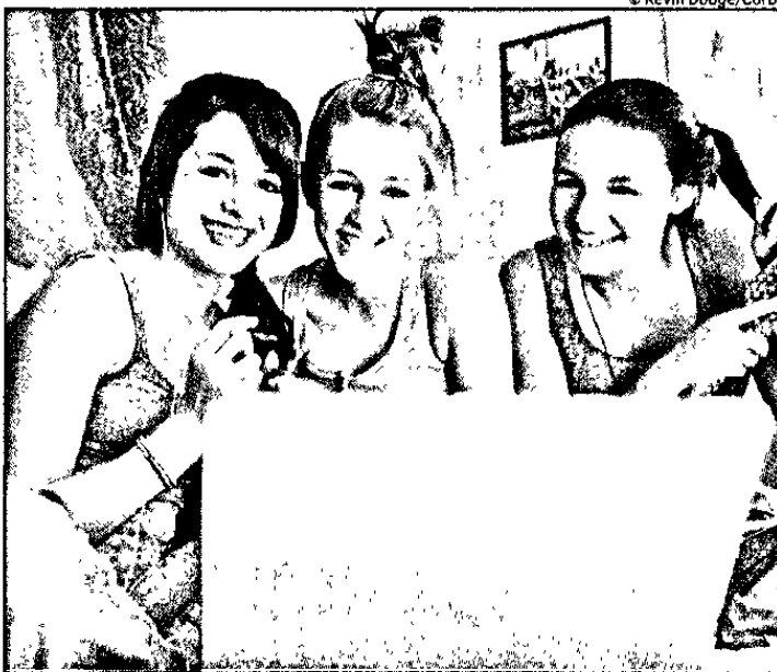
COLD TURKEY? Researchers found that 79% of students when deprived of their mobile phones or computers for just one day reported adverse reactions ranging from distress to confusion and isolation

Some students took their mobile phone with them just to touch them. A British participa-